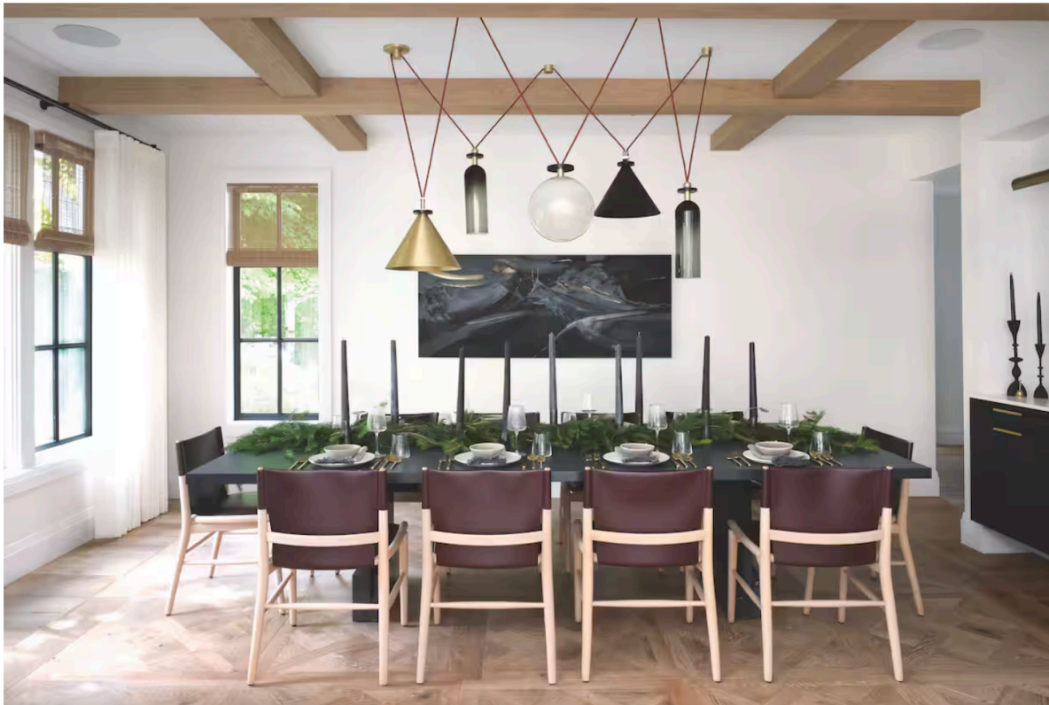
DINING TABLE, Lock and Mortice. Custom CEILING LIGHT, Roll & Hill. DINING CHAIRS, Inform. ARTWORK, Zoe Pawlak. GARLAND, Neve Floral.

"To bring a natural touch for the holidays, we ran a meandering spruce garland down the table's full length, then added a row of one-of-a-kind candles."