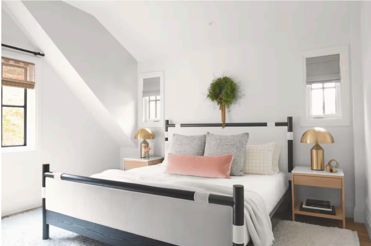
BED, Lawson-Fenning. CHAIR, Once a Tree Furniture. LAMPS, Inform Interiors. NIGHT TABLES, Faithful Roots. Custom CUSHIONS, Stephanie Brown Inc.