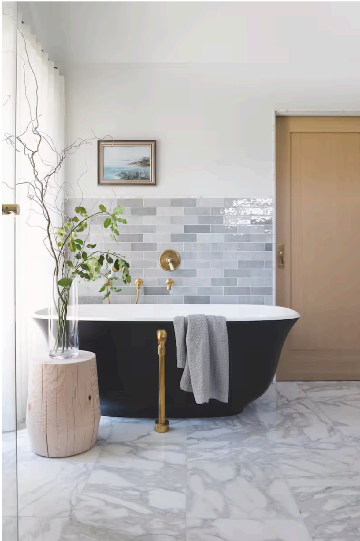
TUB, Victoria & Albert. STOOL, Barter Design. FLOOR TILE, Ann Sacks. WALL TILE, Centura. Curly willow and holly FLORAL ARRANGEMENT, Neve Floral.