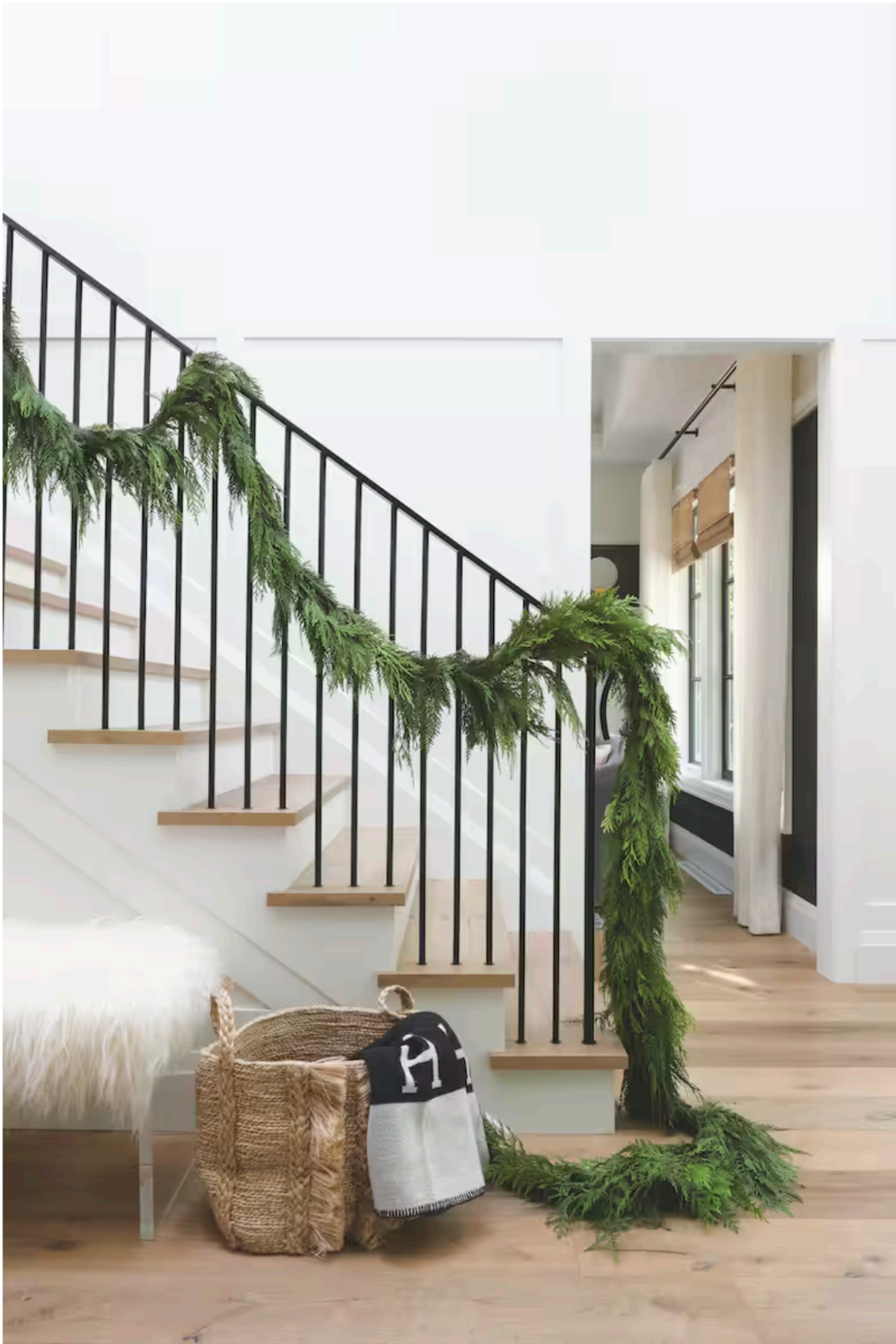
BENCH, CB2. BASKET, Provide. GARLAND, Neve Floral.