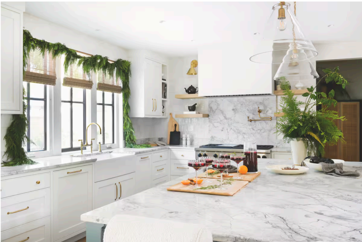
WINDOW GARLAND, FLORAL ARRANGEMENT, ALL GREENERY, Neve Floral. PENDANT LIGHTS, Visual Comfort. SCONCES, Hudson Valley Lighting Group.